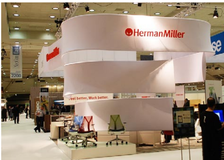
HERMAN MILLER BOOTH: SAYLE CHAIRS DIRTT BOOTH: WALL