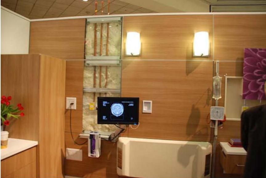
DIRTT: WALLS FOR HEALTHCARE